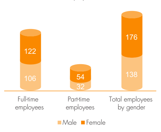
Total employees: 314

Number of employees by age group during the Reporting Period